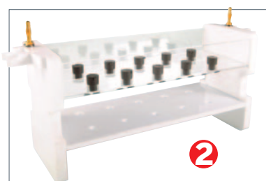
Capillary IEF module, VS10WDCI