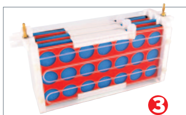
Western Blotting module, VS10WBI